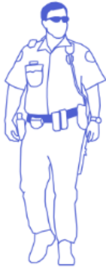
INVESTIGATING OFFICER CARL